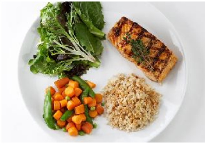
fish, rice and vegetables