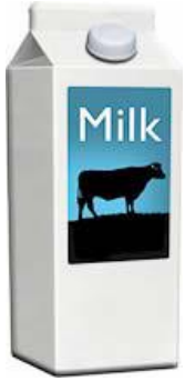
semi skimmed milk