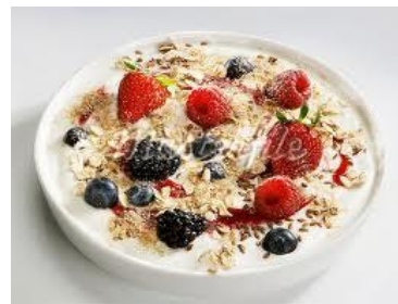
muesli with fruit