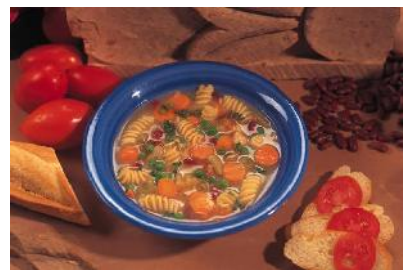
vegetable soup with pasta