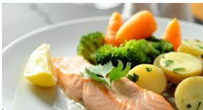
salmon with potatoes