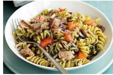
tuna pasta salad