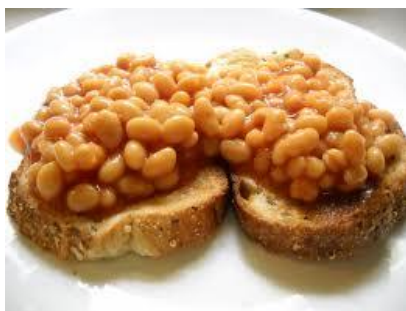
baked beans on toast