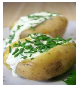
jacket potato with cream cheese