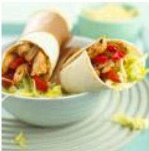
salad wrap with chicken